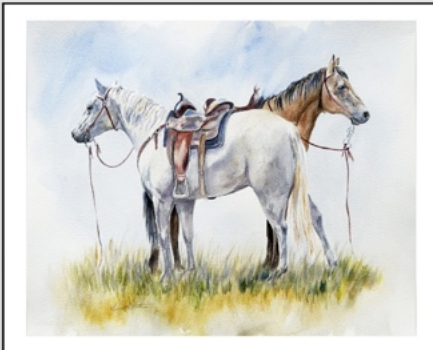
"Lookouts by Priscilla Patterson

Post Falls wildlife and aviation artist Priscilla Patterson has been accepted into the prestigious Cheyenne Days Western Spirit Art Exhibition at the Old West Museum in Cheyenne. The show runs March 7–April 19 and can be seen online as well.