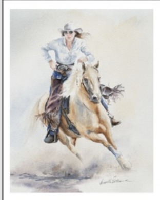
"Quick Draw" by Priscilla Patterson

Inspired by the energy and discipline of mounted shooting events, Patterson’s watercolor work captures both the athleticism of the sport and the quiet vigilance of the horse.