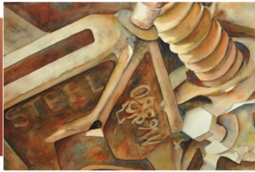
Inner Workings of the Farm